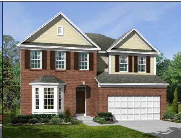
Elevation "D" w/ OPT BONUS ROOM