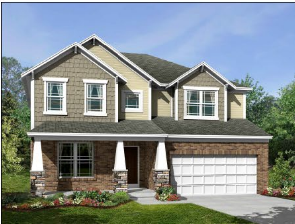
Elevation "C" w/ OPT BONUS ROOM