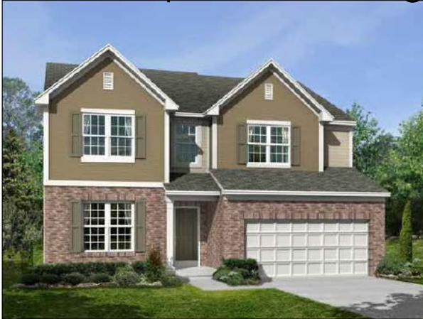
Elevation "A" w/ OPT BONUS ROOM

$450,995 Expected Average Sales Price w/$30k Options