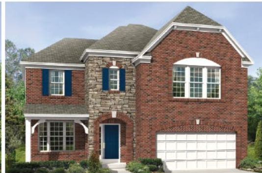
Elevation D - Shown w/Opt Stone