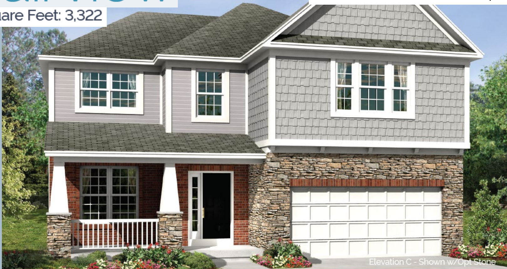
Elevation C - Shown w/Opt Stone

$464,995 Expected Average Sales Price w/$30k Options