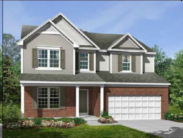
Elevation "B" w/ OPT BONUS ROOM