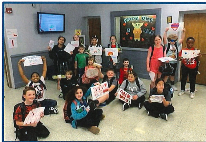
THE KIDS GAVE A WARM WELCOME TO OFFICERS DURING A VISIT TO FAIRFIELD EAST ELEMENTARY